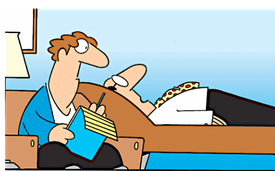
"Opportunity texted me, tweeted me, linked to me, friended me, blogged me and spammed me. I was expecting it to knock!"

The next edition will be ready for distribution on February 4 (next Sunday).